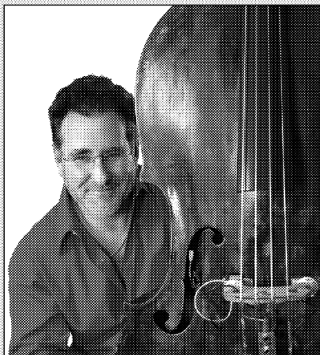
Downright Upright & More